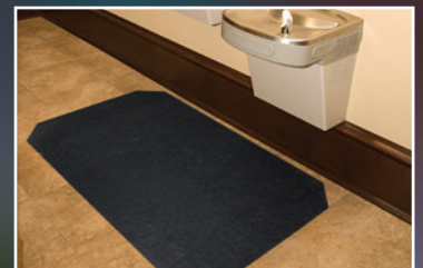
CleanShield® Roll Goods (Adhesive-Back Matting)