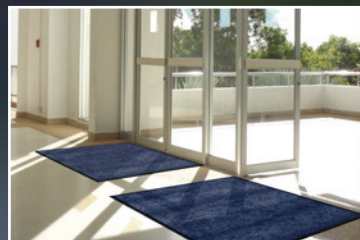
ColorStar® (PET fabric features 100% recycled content reclaimed from plastics)

By preventing contaminants from entering a facility, mats will substantially reduce the need for cleaning chemicals that might be harmful to building occupants and the environment. M+A is committed to developing and manufacturing eco-friendly products, reusing and recycling materials as often as possible.